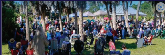
Honeymoon Island State Park

https://www.friendsoftheislandparks.org/events